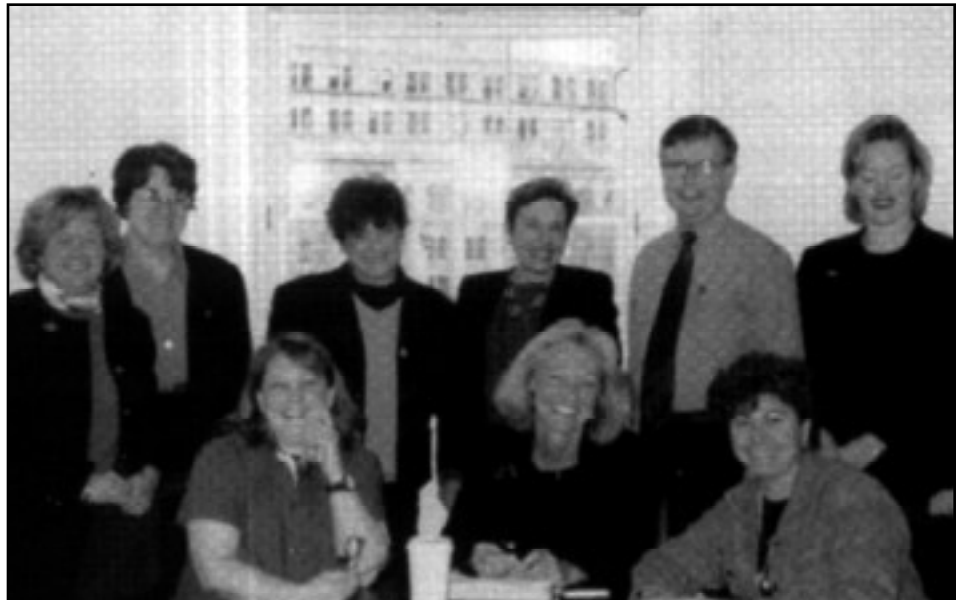
Heritage Tourism Steering Committee meeting at the Octagon House