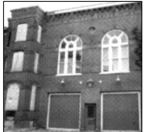
Old Engine Company 6 (ca. 1864), 438 Massachusetts Avenue, NW