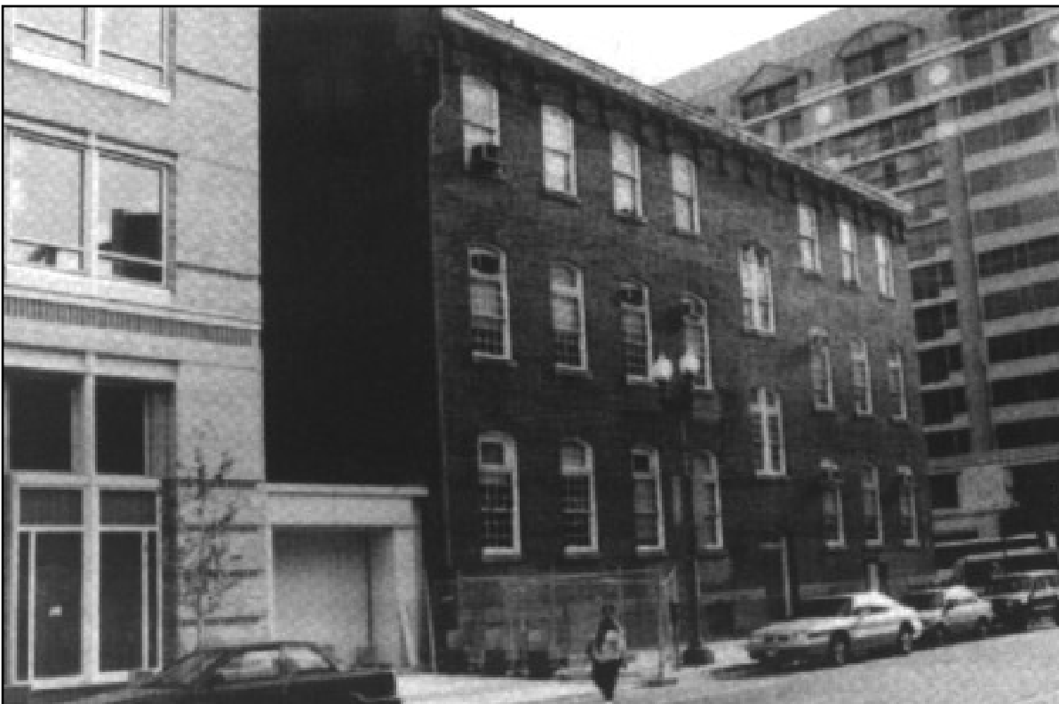
The Webster School (1882) at 740 H Street, NW