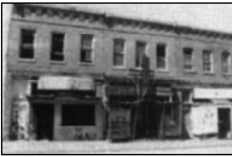
Anacostia Historic District, SE