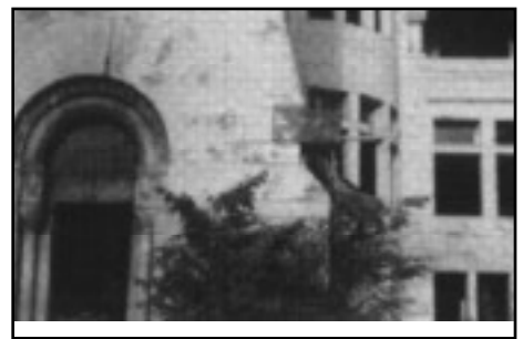
Warder-Totten House, 2633 14th Street, NW

Of the 29 pre-World II firehouses and 1 fire alarm headquarters that remain in Washington, 19 are still owned by the city. Six of these, as individual landmarks or buildings that contribute to historic districts, are protected by the city's preservation ordinance. Possible alteration or actual demolition threaten the remaining 13. These firehouses, dating from 1864 to 1939, were designed as landmarks for their respective neighborhoods. They are significant not only for their