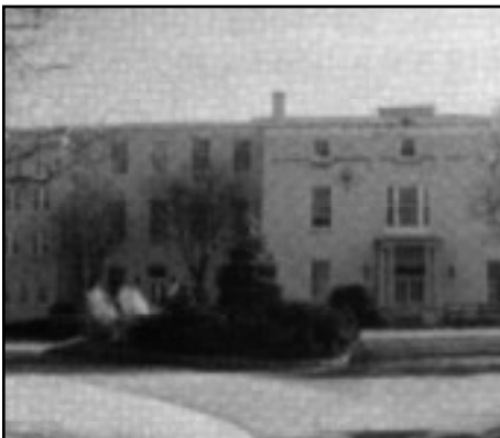
Brooks Mansion, 901 Newton Street, NE