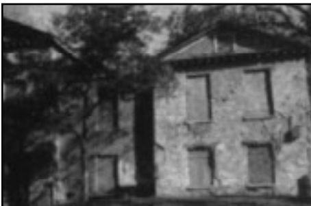
Holt House, National Zoological Park, Adams Mill Road, NW