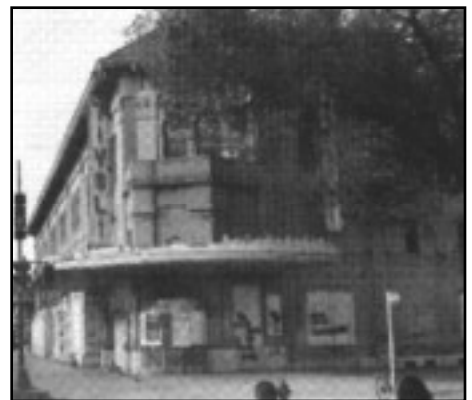
Tivoli Theater, 14th Street and Park Road, NW