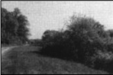
Anacostia River Basin, A Cultural Landscape