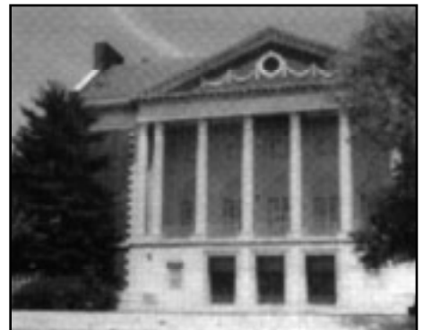
The McKinley School (1928), 151 T Street, NE